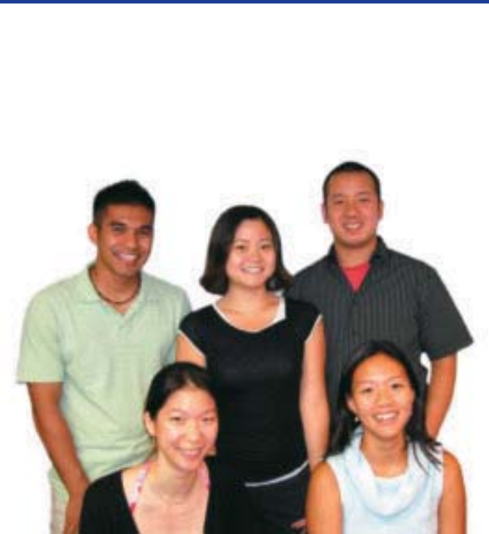
Qhov ntawm no, yog Federal txojcai uas pub kev ncaj nceeg rau koj. Tsab kev cai ntawm no, hu ua Title VI ntawm txuj cai Civil Rights Act ntawm xyoo 1964.